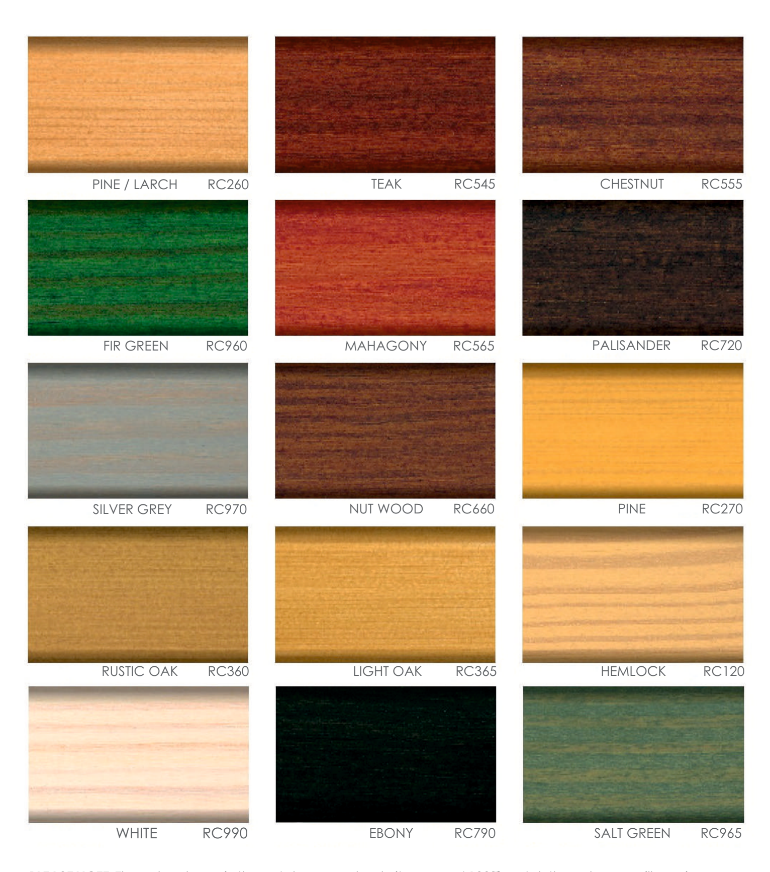
PLEASE NOTE: The colors shown in the catalogue and website may not 100% match the color you will receive. The color of the wood material affects the final color.

Water-based, quick drying premium total protection for wood outside. Thin layer varnish – 3 in 1: impregnation, primer, and varnish!