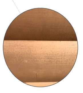
TREATED WITH WOOD STAIN